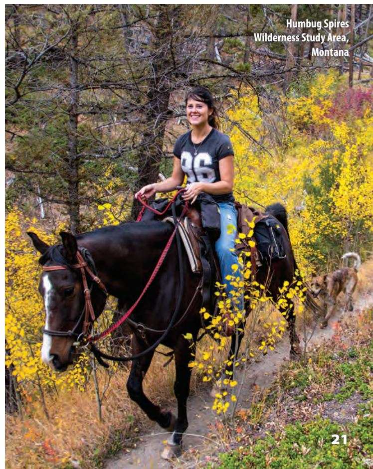
Humbug Spires Wilderness Study Area, Montana